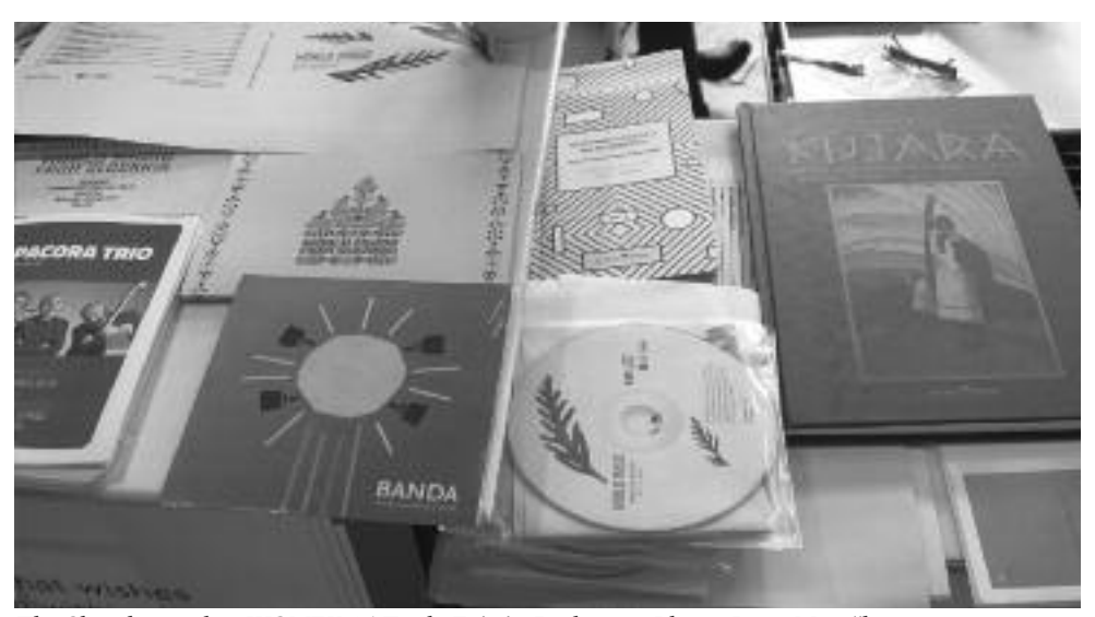
The Slovak stand at WOMEX 15 Trade Fair in Budapest.

Being Is Illegal (even with a home-made password I love Budapest, but I hate Orbán), people were discussing these topics everywhere, because crossing cultures is their everyday job and they are very sensitive to all these matters. Delegates of WOMEX 15 supported also various NGOs and aid organisations helping refugees and they took a group photo