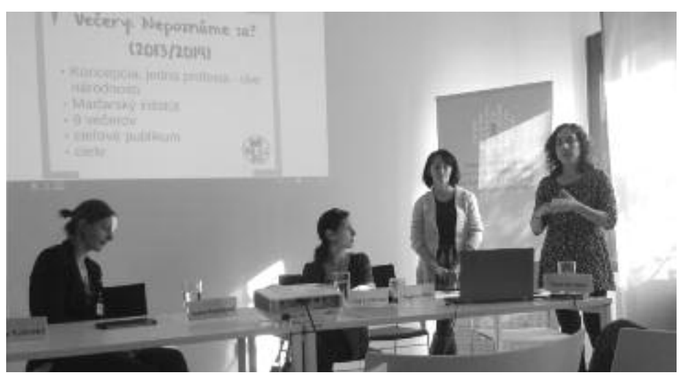
Participants to the conference Civil Activities and Engaged Research.

17 papers in total were presented at the conference by various academic departments, non-governmental organisations and practitioners. The conference was interdisciplinary in the full sense of the word, gathering academics and activists, experts in ethnology and anthropology, sociology, human geography, as well as linguistics. What was common to them was primarily their interest in applied research. Most papers focused on the ethical and methodological dilemmas of researchers. One of the specific features of applied research is its emphasis on outputs which often aim to enhance the knowledge of the general public or to policies or the development of the communities subject to research. Researchers therefore often face the problem of how to approach their communicators, to what degree to intervene in the given environment, and how to synchronise their different roles in the field (research and activism).