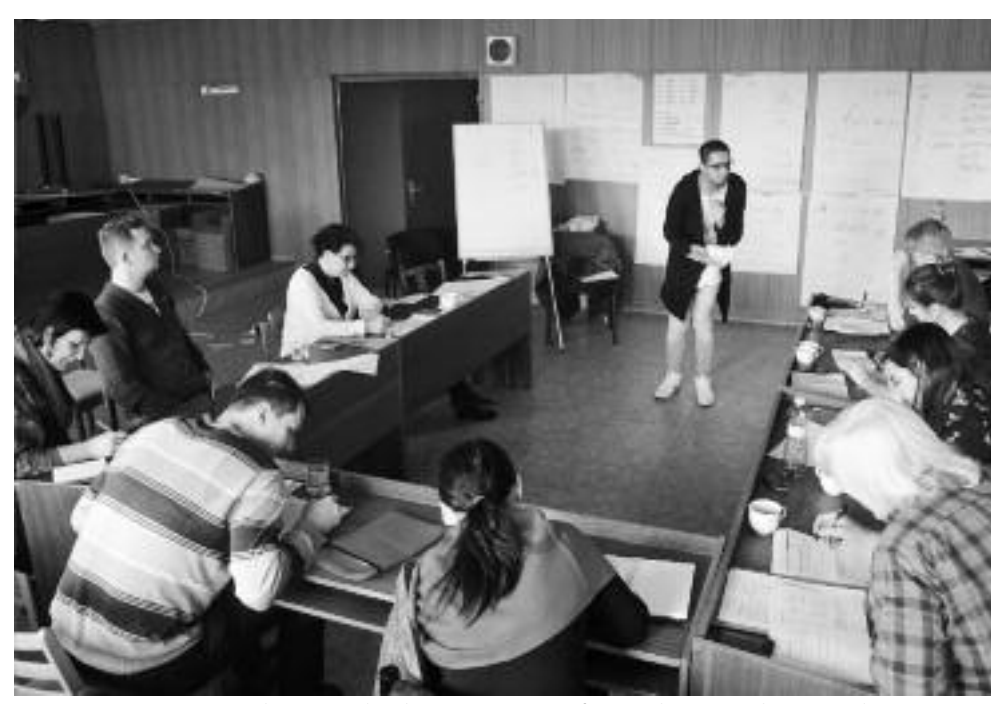
Conversations in Roma language by the participants of Roma language lessons.