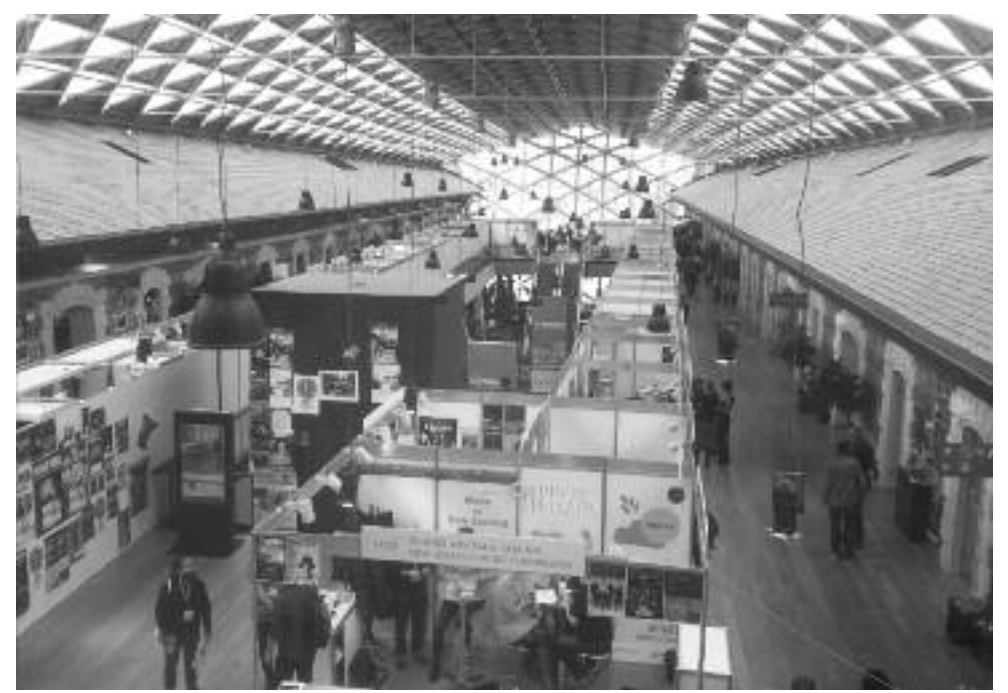
The building of Bálna (The Whale) in Budapest where Trade Fair took its place.