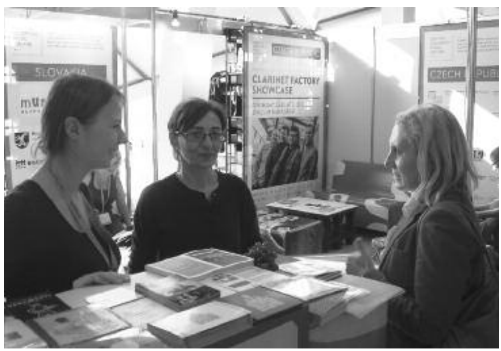
The Slovak stand at WOMEX 15 Trade Fair in Budapest.

pretty combination of swing and Slovakian and Moldavian folklore.