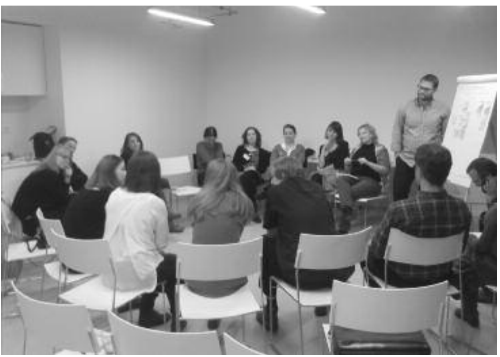
Participants to the conference Civil Activities and Engaged Research and poster.