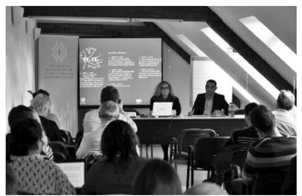
Participants to the Academy of Roma Studies.